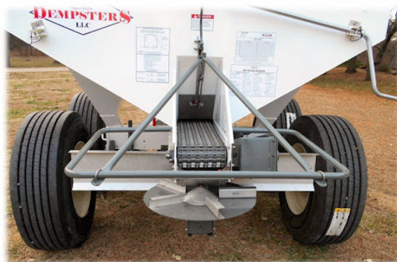
60' Spread Pattern (up to 90')